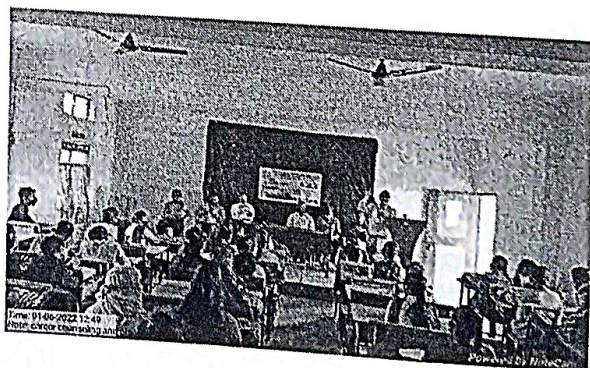
The photographic event of the programme.