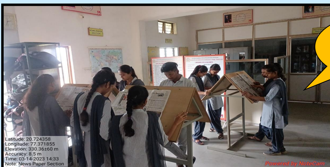
News Paper Section