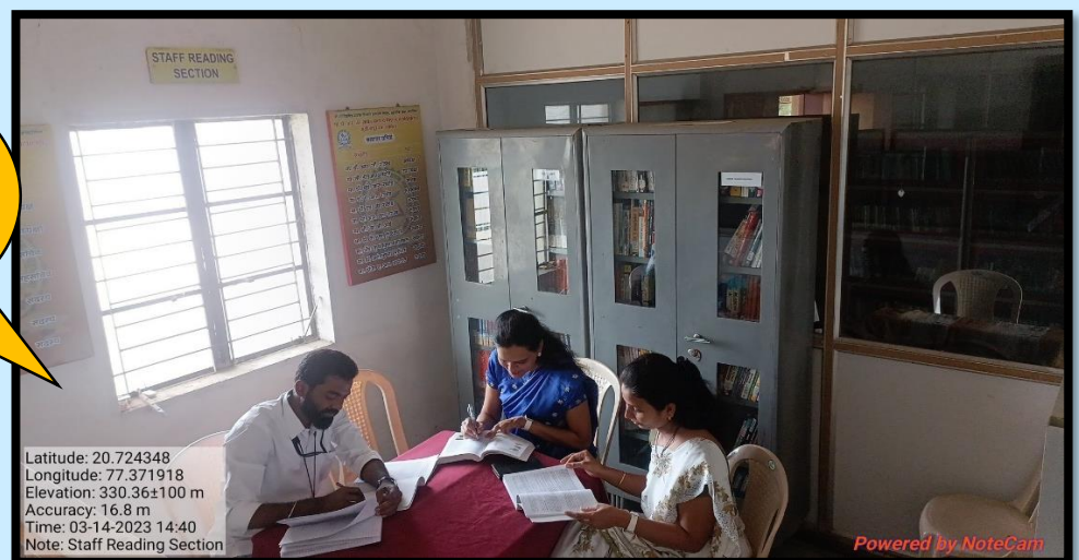
Staff Reading Section