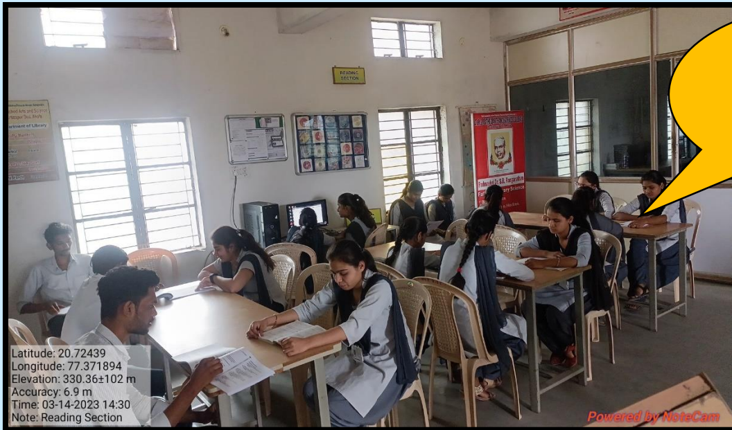
Students Reading Section