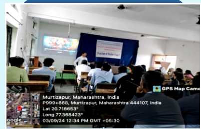
Introduction To AI & ML Programme