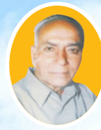
Shri. Govindsinh Rathod Shikshan Prasarak Mandal, Dahatonda's