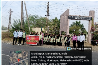
AIDS Awareness Rally