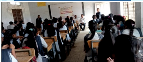
History Study Forum Inauguration