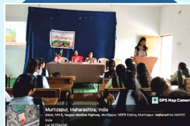
Workshop on National Health Importance