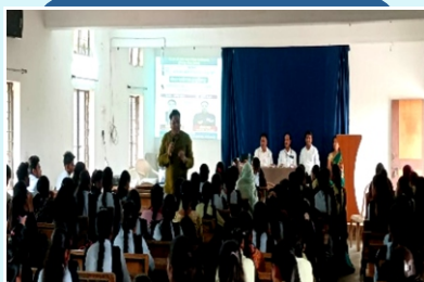
Guidance Workshop on Competitive Examination