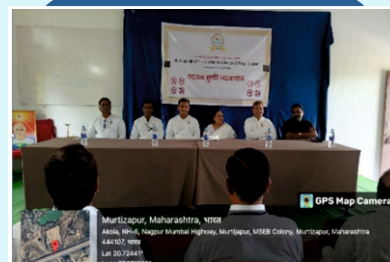
Vaisan Mukti Program