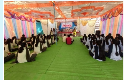
N.S.S. Camp at Hatgaon