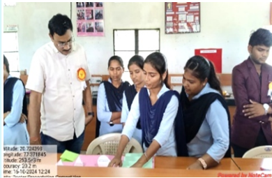
Poster Presentation Competition