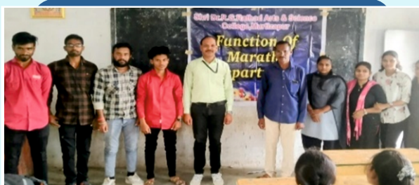
Marathi Din Celebration