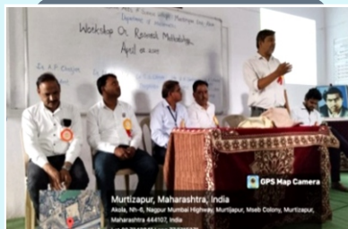
Workshop on Research Methodology