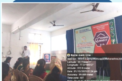
NEP School Connect Program