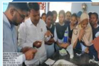
Workshop on Paneer Production & Detection of Adulteration