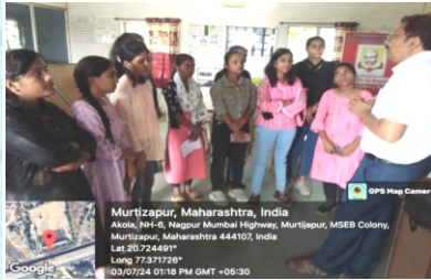
Institutional Workshop on Library Orientation