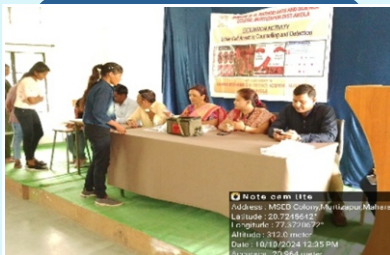
Sickle Cell Program