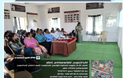
Ph.D Open Defence Viva-Voce