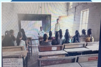
AIDS Awareness Program Empowerment