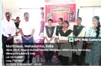
Vachan Sankalp Maharashtra