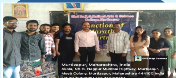
Marathi Study Forum Inauguration