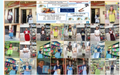
Selfie with Book