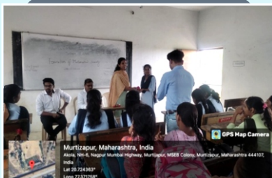
Mathematical Society Formation