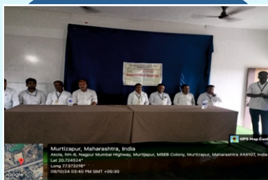
Sociology Society Inauguration