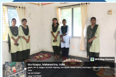
Nutrition Week Celebration