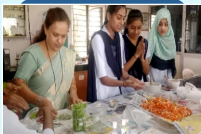
Natural & Herbal Colour Day Workshop