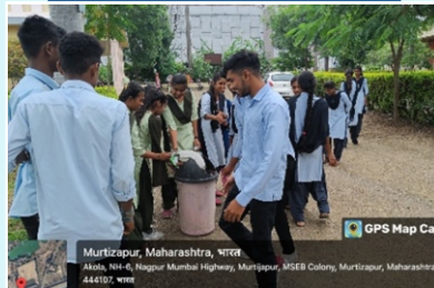
NSS Day Celebration