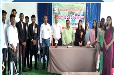
Inauguration of Chemical Society